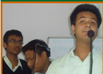
Our major students in one of the competitions