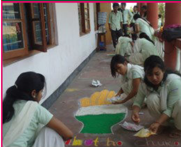
Our students busy in the Rongoli Competition, organized by the Dept. of Pol. Sc. as part of voter sensitization campaign 26.03.2014