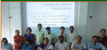
Teachers who altruistically helps us organised Debate Competition, 2014